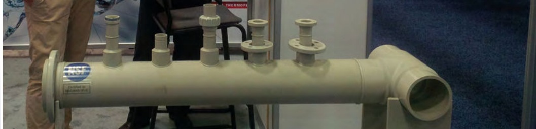
left to right: SIMONA® PP-H AlphaPlus® Products; exhibit of a header with various outlet points and joining solutions by SIMONA